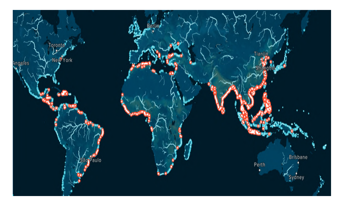
Figure 4.1: River plastic pollution sources map from The Ocean Cleanup <sup>53</sup>