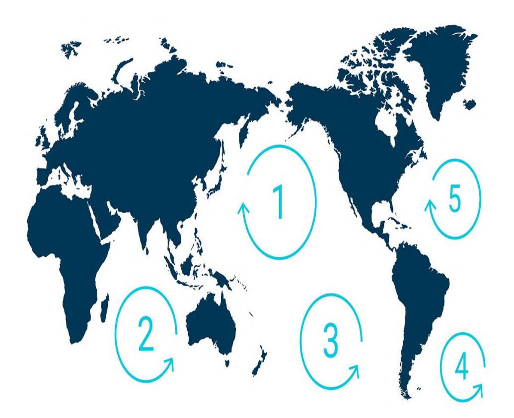
Figure 2: Map of the five gyres of ocean plastic from The Ocean Cleanup 54