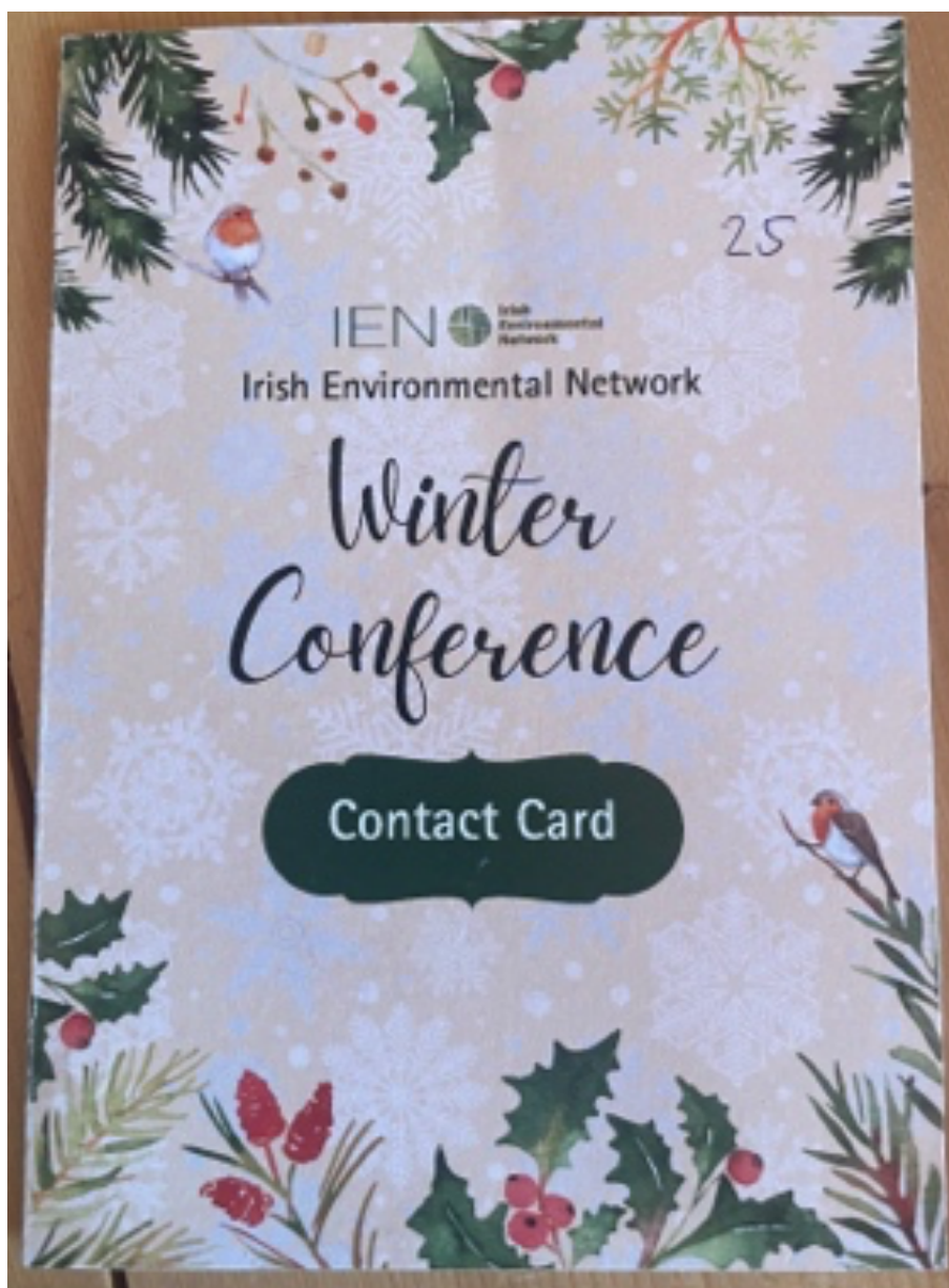
Figure 1. Irish Environmental Network Contact Card

It became clear that all of us have important work to do, and that we are actively concerned about many environmental and closely associated problems including: climate, nature, the need for recycling/reusing, sustainability, the circular economy, public transport, the built environment, poverty, inequality and social exclusion. The networking exercise also helped to show the interconnected nature of all these environmental issues.