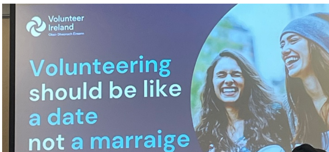
Figure 2. Volunteer Ireland definition of volunteering

At the end of the discussion, Stuart Garland showed a projection which stated that " Volunteering should be like a date and not a marriage ".